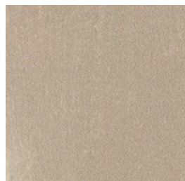
L558 Rock Beige Boiaccia