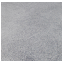
L2810 Rock Taiga