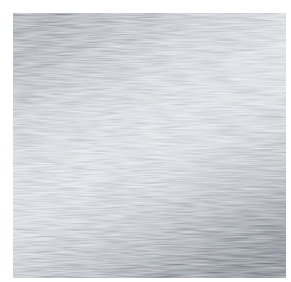
Satinized/Satinato steel satinized